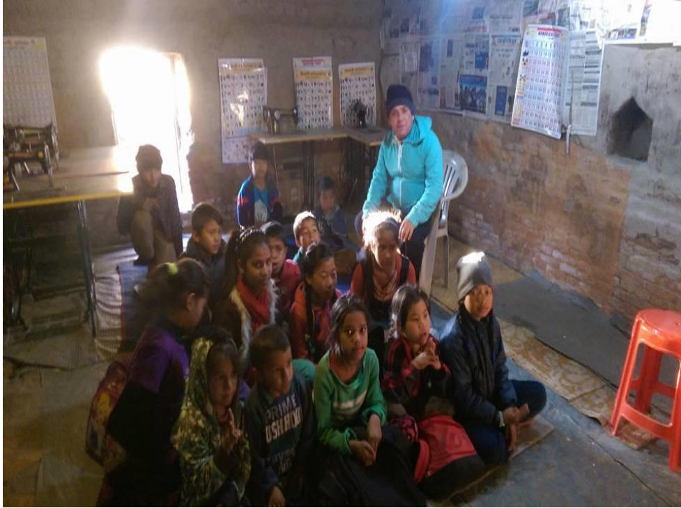
Jan- 31, Improvement results of Nubisma.